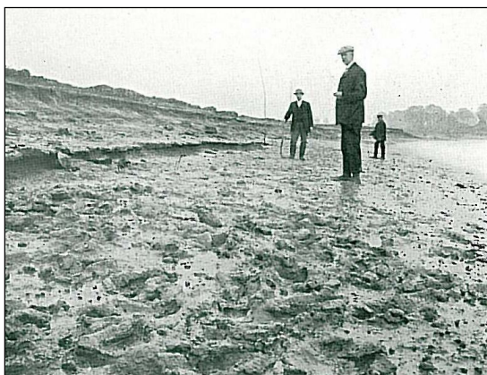
A photograph of the bed of the River Crouch at Hullbridge taken before the First World War.

WILKINSON, T.J. and MURPHY, P.L 1995. The Archaeology of the Essex Coast, Volume 1: The Hullbridge Survey. East Anglian Archaeology Report No.71 . Essex County Council. Pages 90-100.