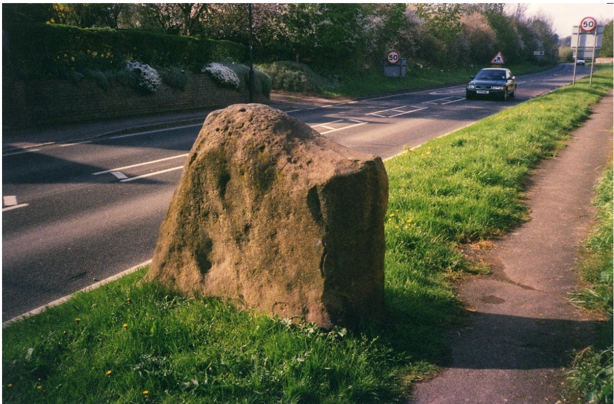
The Leper Stone.