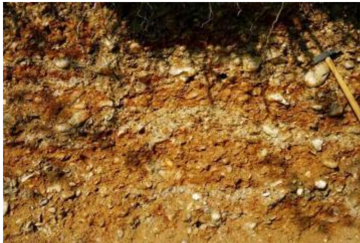
Gravel-pit in College Wood near Blackmore. Cryoturbated, rather clayey sand and gravel. The white angular pebbles are patinated flint. The well-rounded pebbles consist mostly of flint but some vein quartz. Photo © British Geological Survey (P212163).

The disused gravel pits were dug in Ice Age gravels. The origin of this gravel, is unclear. Exposures of this gravel therefore have the potential for future research. The gravel in College Wood contains vein quartz, quartzite and rare Lower Greensand pebbles which is a rather different pebble assemblage compared to occurrences that have been assigned as “Stanmore Gravel” elsewhere in the area.