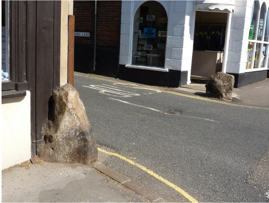
Sarsen boulders either side of Fryerning Lane at the junction with the High Street.