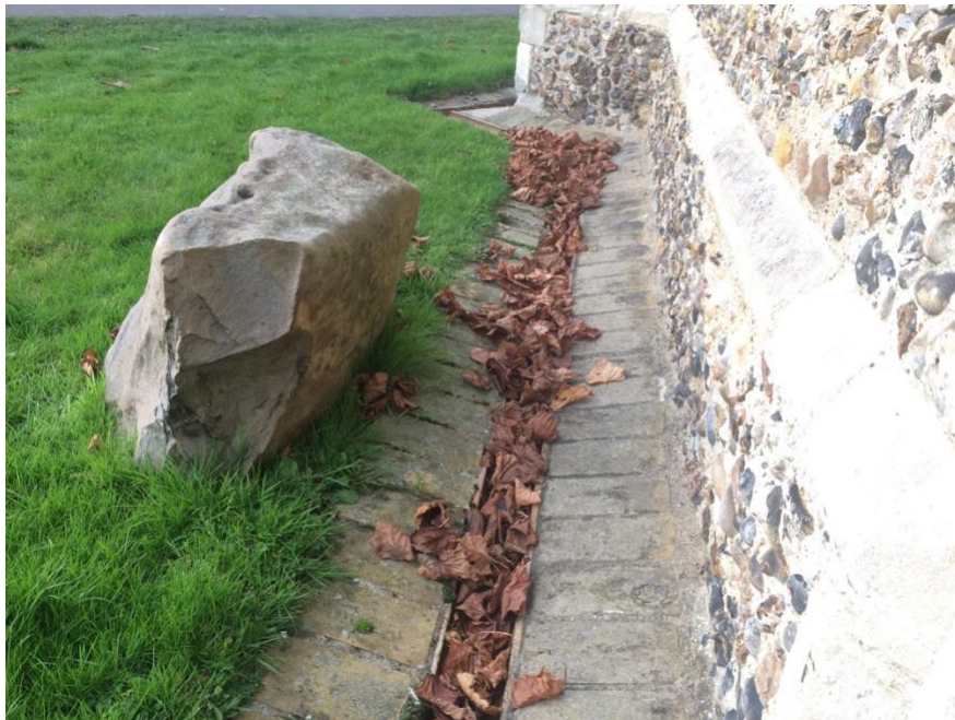
Sarsen next to the south wall of Ingatestone church.