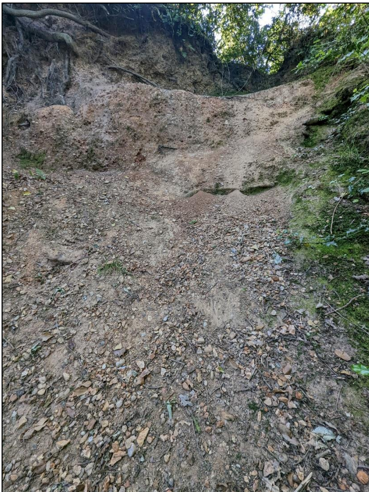
Exposed gravel in the side of the western pit.