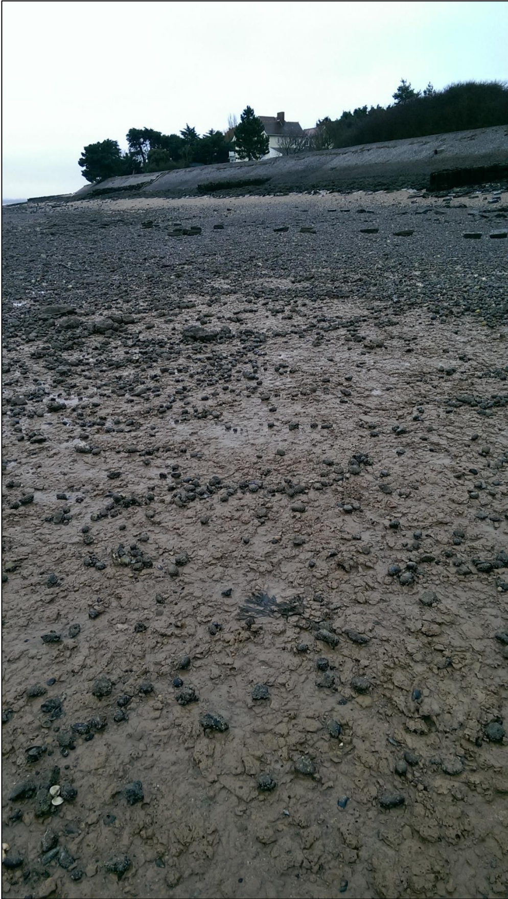
The London Clay exposure on the foreshore in front of Stansgate Abbey Farm. Photo: 2014.