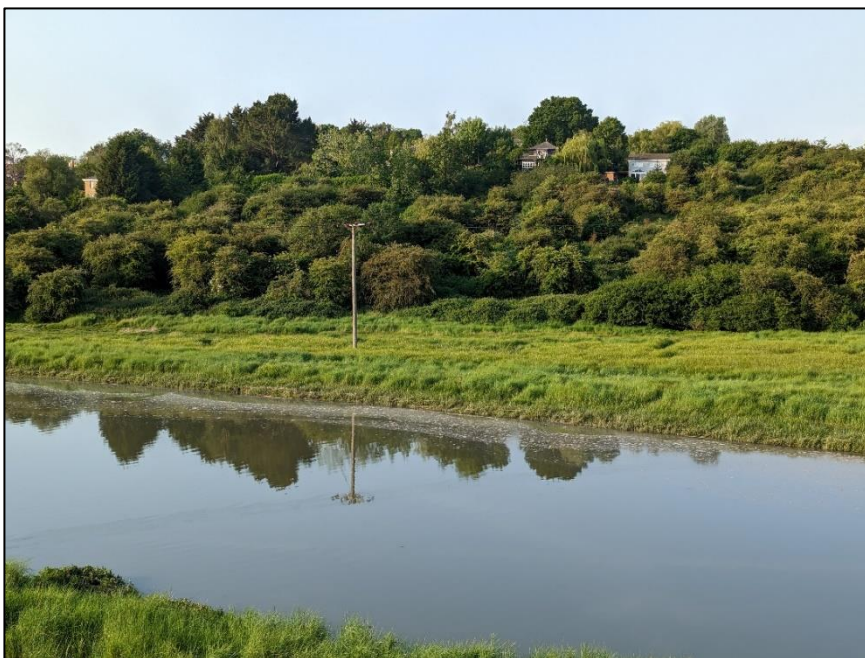
The West Maldon landslip, June 2023

View of the West Maldon landslip looking south in 1968. The site has now been largely covered with trees and shrubs. Photo: British Geological survey (P210814). The surface of the landslip ground is characteristically hummocky and covered with brambles. This could be clearly seen from the Maldon By-pass (see photograph) but trees have now largely covered the slope. A public footpath traverses the landslip, appropriately called Hilly Fields Wildlife Site.