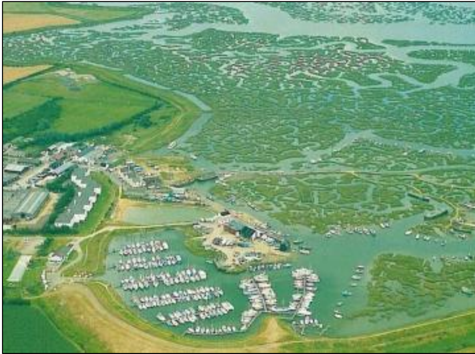
Woodrolfe Creek salt marshes from the air.

Radiocarbon dating of plant remains at a depth of 3.5 metres in recent borehole at the edge of the saltmarsh at Tollesbury has produced a date of almost 5,000 years. It was concluded that the growth rate of the saltmarsh has been nearly constant with an accretion of about 1.5 millimetres per year.