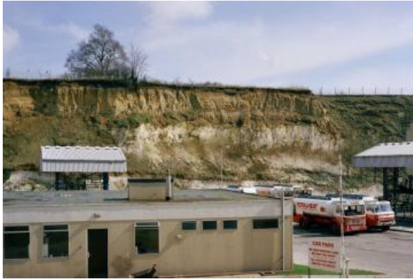
Sandy Lane Chalk Quarry