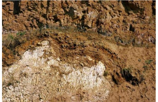
Chalk and Thanet Sand junction at Sandy Lane Quarry