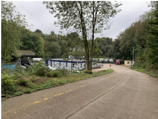
Sandy Lane Chalk Quarry - looking north at entrance to oil depot, TL860406