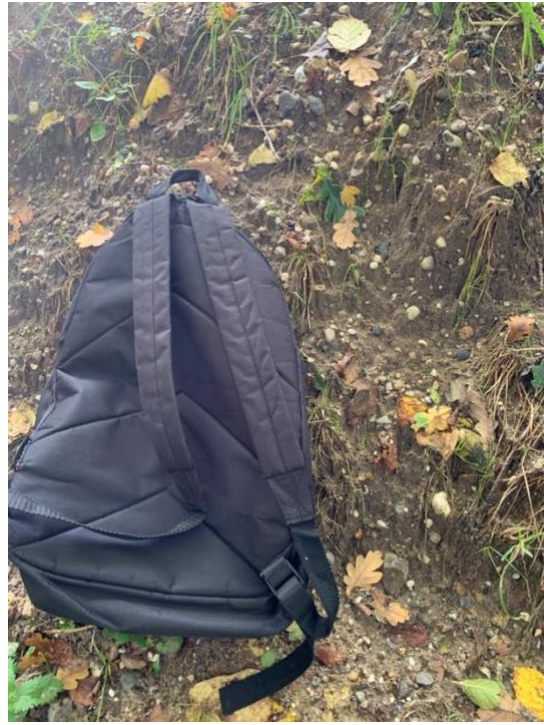
Alphamstone Gravel Pits - gravelly soil in wood at grid ref TL873854, Nov 2023