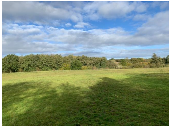
Alphamstone Gravel Pits - looking north towards site of pits from grid ref TL873354, Nov 2023