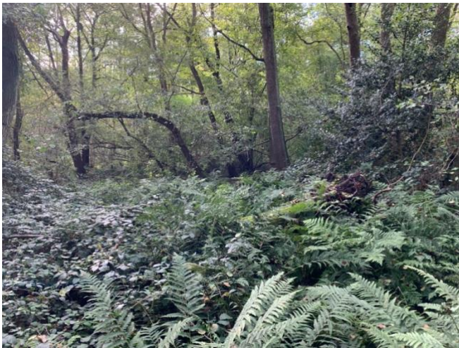
Alphamstone Gravel Pits - in wooded old pit area, looking southwest at grid ref TL873355, Nov 2023