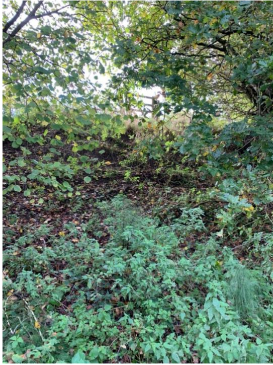
Alphamstone Gravel Pits - at entrance to wood, looking south at grid ref TL873854, Nov 2023