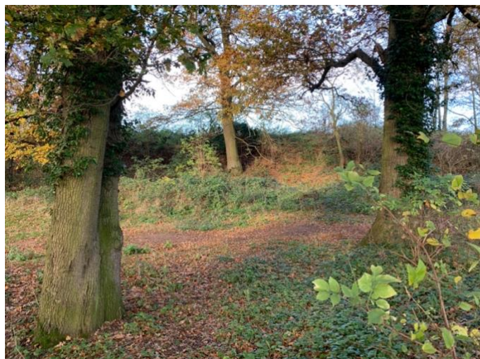
Brick Kiln Hill Brickworks Pit - looking N to wooded former pit area from road, at TL7725535373