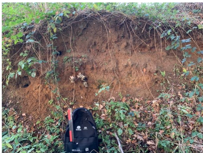
Brick Kiln Hill Brickworks Pit - #5 - exposed low cliff on north side of former pit area