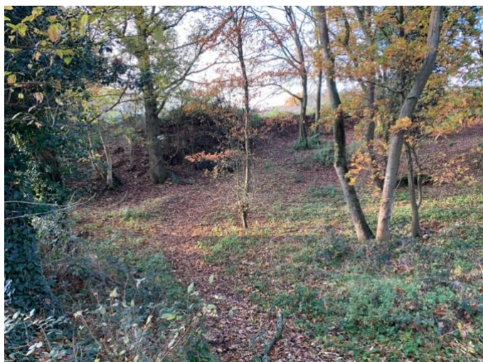
Brick Kiln Hill Brickworks Pit - looking NW to wooded former pit area from TL7722635365