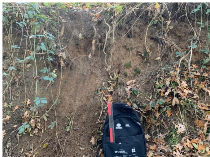
Brick Kiln Hill Brickworks Pit - #4 - exposed low cliff on west side of former pit area