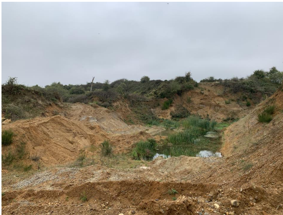
Ferriers Farm Pit - looking North from TL896340 (photo D Potts, 2024)