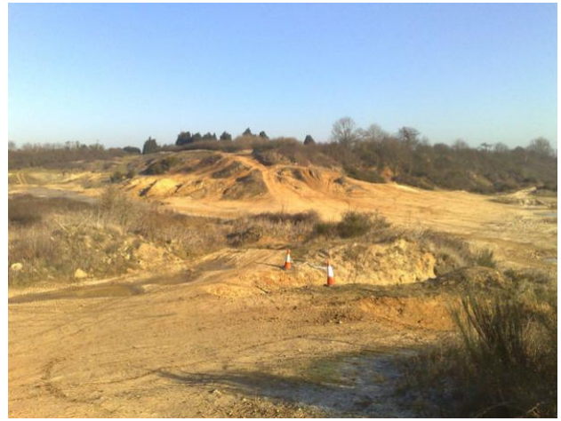
Bures Pit used for motorsport bures-pit.co.uk website 2019