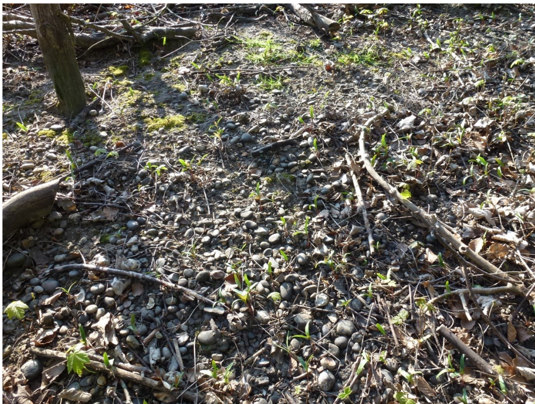
Warley Gravel at Holdens Wood photo April 2021 R Mercer