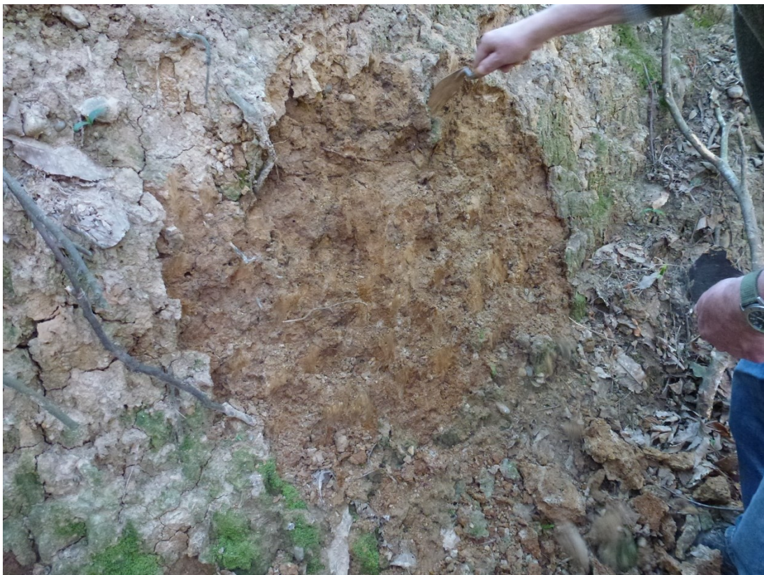
Bagshot Sand in stream section on the western boundary of Holdens Wood. Photo 2021 R Mercer