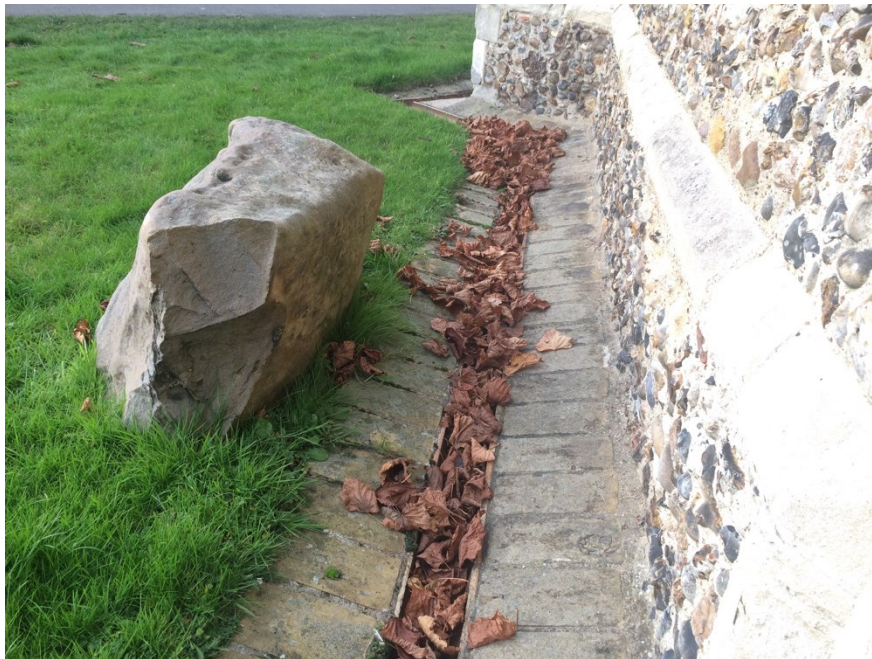
Sarsen next to the south wall of Ingatestone church.