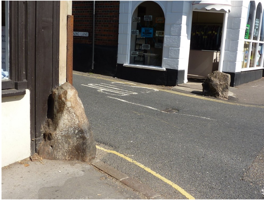
Sarsen boulders either side of Fryerning Lane at the junction with the High Street. Photo2013