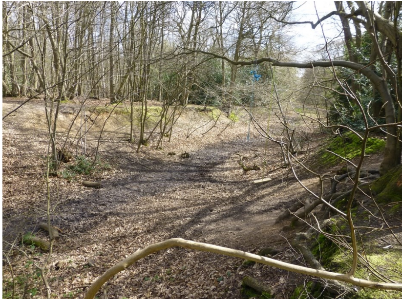
Scrubs Wood April 2018