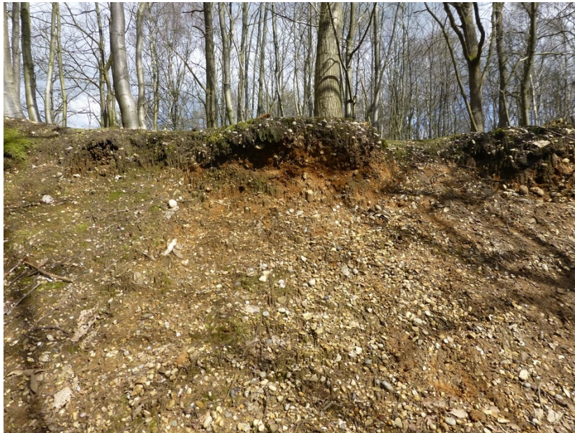
Close-up Scrubs Wood April 2018