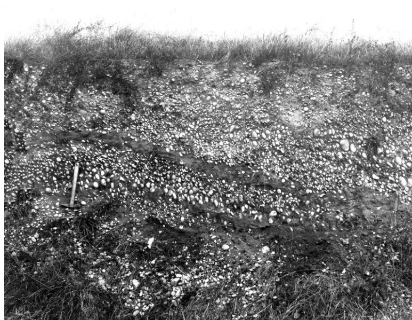
Disturbed Bagshot Pebble Bed revealed in the gravel pit near Stock. The photograph was taken in 1923. Photo: British Geological Survey (P202467)