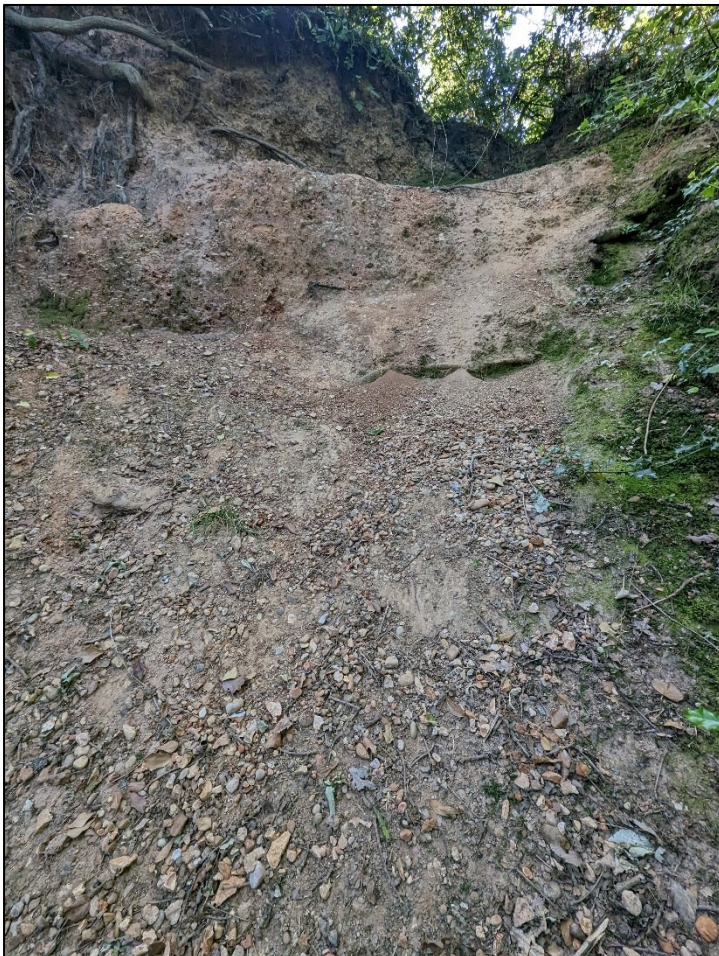
Exposed gravel in the side of the western pit.