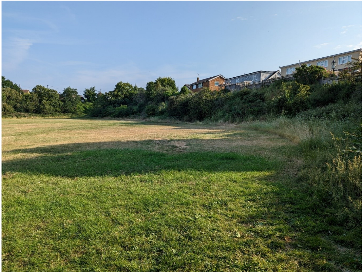
Part of the eastern Jubilee Recreation Ground field, showing steep vegetated sides