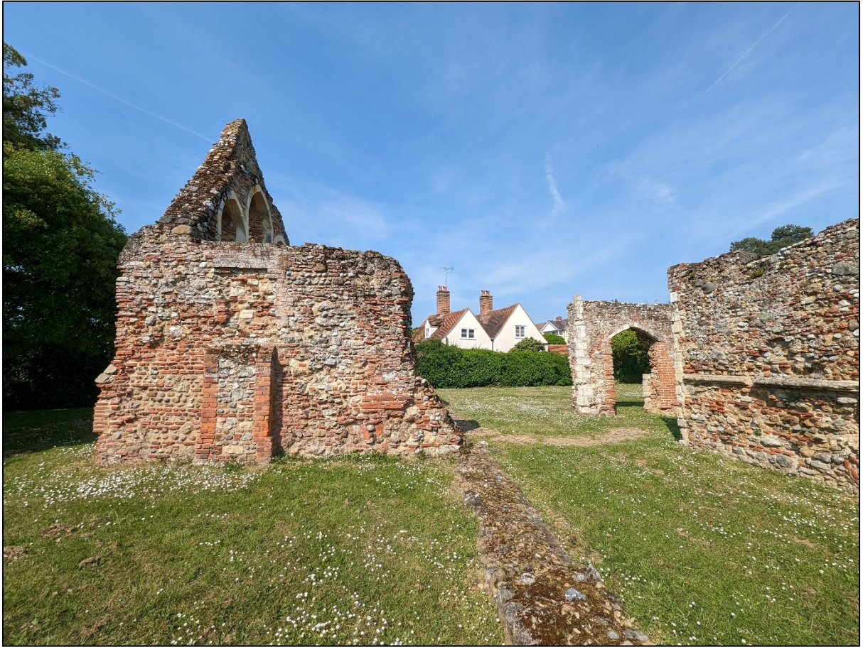
General view of the ruins