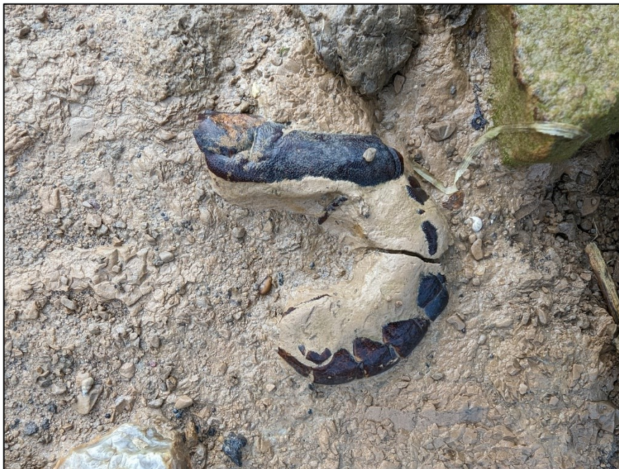
A fossil Hoploparia gammaroides lobster in situ in the clay foreshore. Photo: Jeff Saward, December 2022.