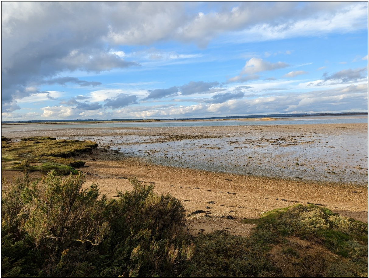
The London Clay exposure on the foreshore at Steeple Bay, with Mundon Stone Point In the background. Photo: Jeff Saward, January 2023.