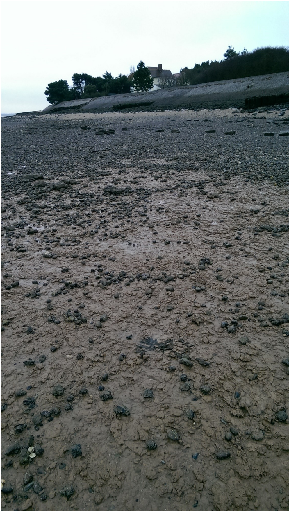
The London Clay exposure on the foreshore in front of Stansgate Abbey Farm.