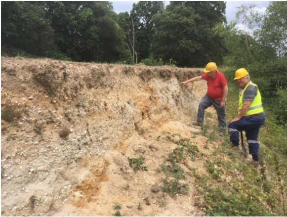
Formerly exposed gravels.