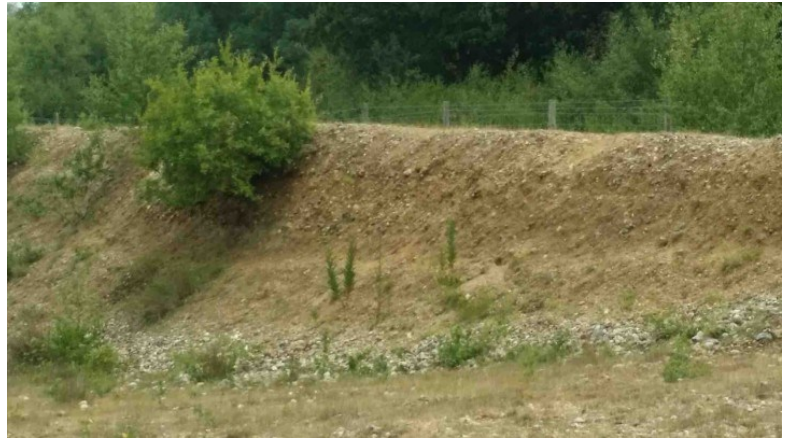
Section that could be excavated to reveal a section through the gravels.