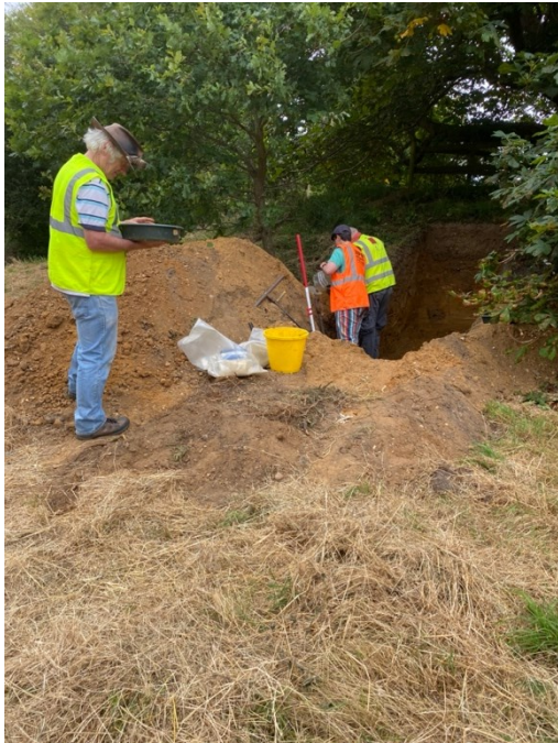
Recent excavation pit 1 Photo: Ros Mercer, August 2024

Wymer 1985 (p.261-263), Bridgland 1994 (p.363), Wymer 1999 (p.103).