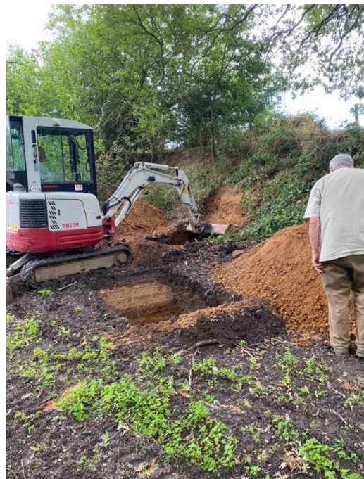
Recent excavations pit 2 & pit 3. Photo: Ros Mercer, August 2024