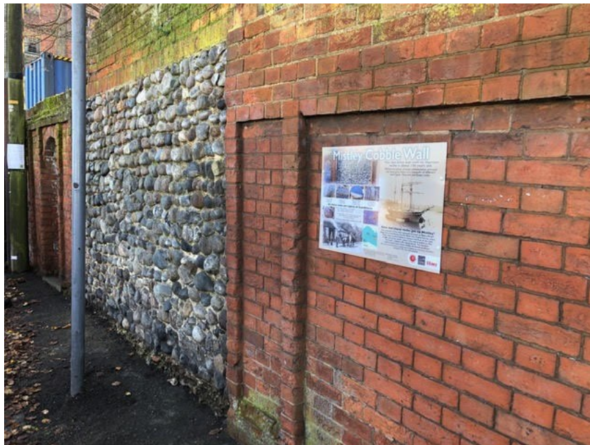
Mistley Cobble Wall with signboard. Photo: I. Mercer, Nov. 2023