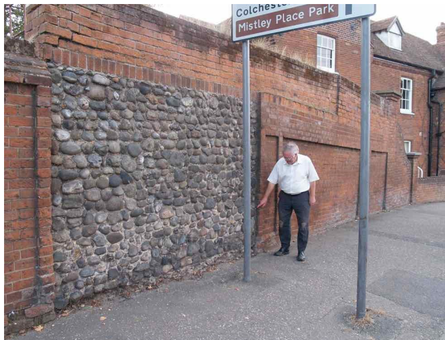
The cobble wall in Mistley High Street.

MERCER, I.F. 2014. A Mistley Mystery. Magazine of the Geologists' Association . Vol. 13, No.4. 2014. Pages 29-31.