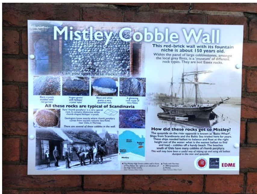
Mistley Cobble Wall Signboard. Photo: I. Mercer, Nov. 2023