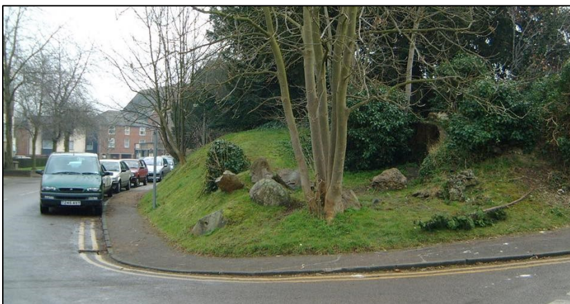
The Gibson Boulders.