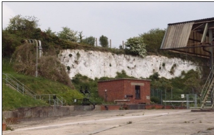
View of Radwinter Road Chalk Quarry from Radwinter Road.

OSBORNE WHITE, H.J. 1932 The Geology of the Country near Saffron Walden . Memoirs of the Geological Survey, England and Wales. Explanation of Sheet 205. Pages 41-42.